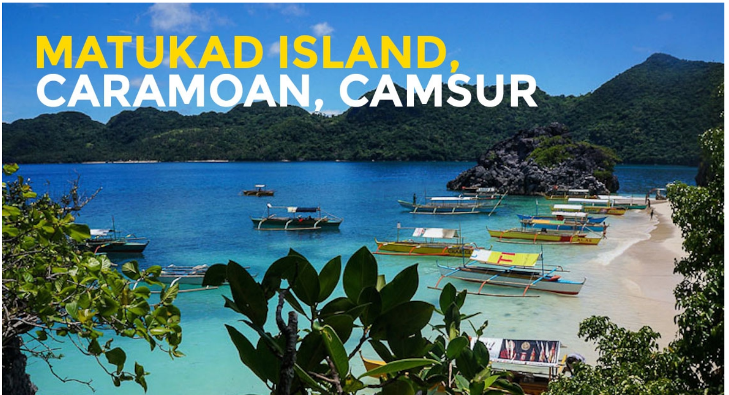
GOTA BEECH. Filming location of Survivor island