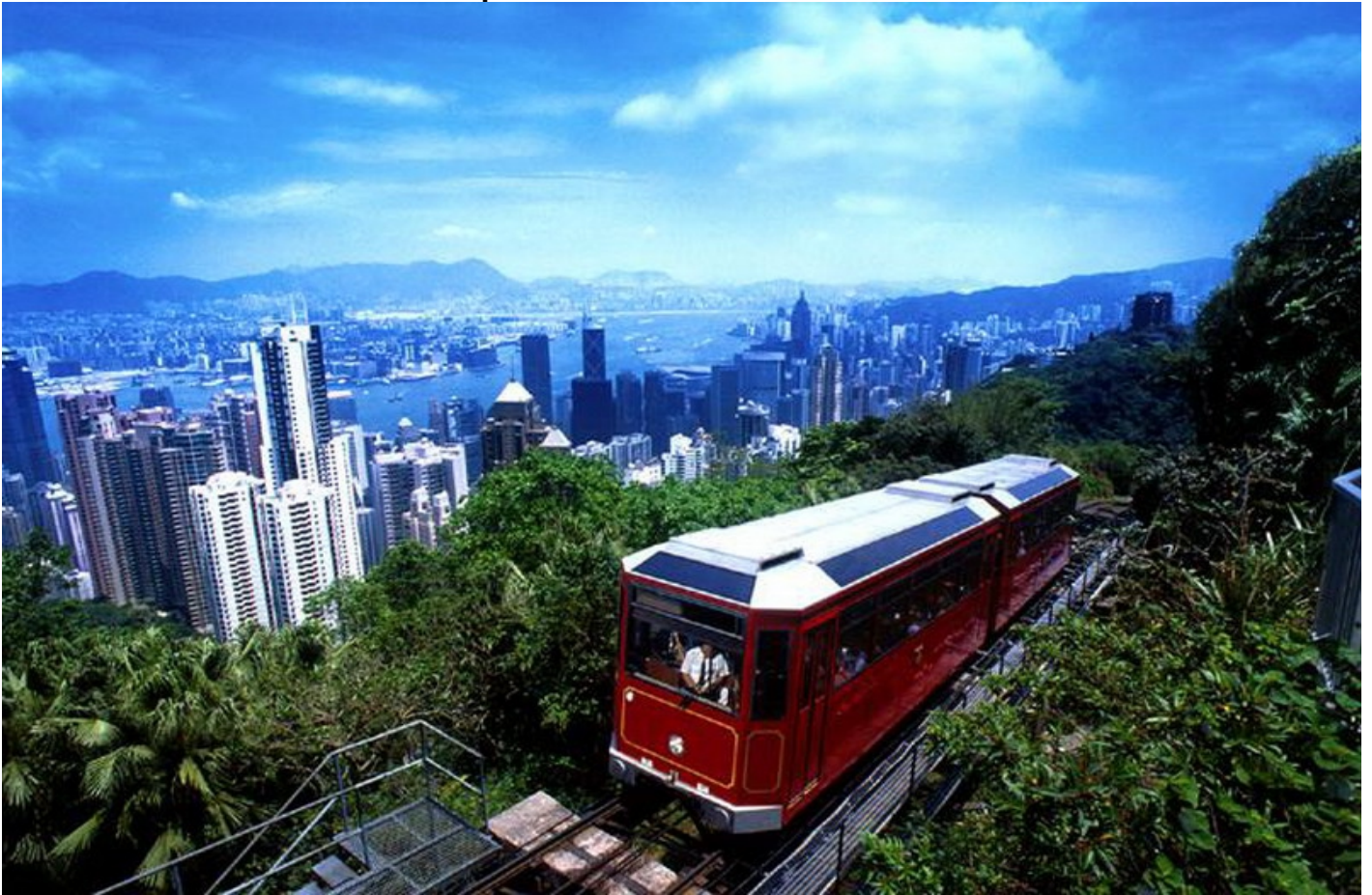
Viewing Platform At Peak Sky Pass.

Best view of Hong Kong ,includes peak tram and peak tram sky pass viewing Transport and entrance tickets include